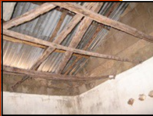
Clinic roof repairs being considered.

The medical clinic at Nana, near Medina Wallum, will be assessed for physical improvements such as a roof and lighting, as well as basic medical needs to improve care to the ten area villages served.