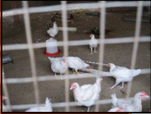
Poultry farm chicks

In September, volunteers will visit the Early Childhood Development Center in Munyagen, built with your donated funds. This project includes development of a poultry farm and community garden which can be sustained by community members. It is hoped that the farming enterprise will bring much needed income to this community. So far, the building that houses the school has been rehabilitated and the poultry farm has been completed. We are looking forward to seeing the progress of these first two phases before funding the last phase, the community garden. HopeFirst Foundation is collaborating with CEDAG , a Gambian NGO whose accountability has been impeccable to date. We strive to be trustworthy stewards of your contributions and expect transparency from those with whom we collaborate.